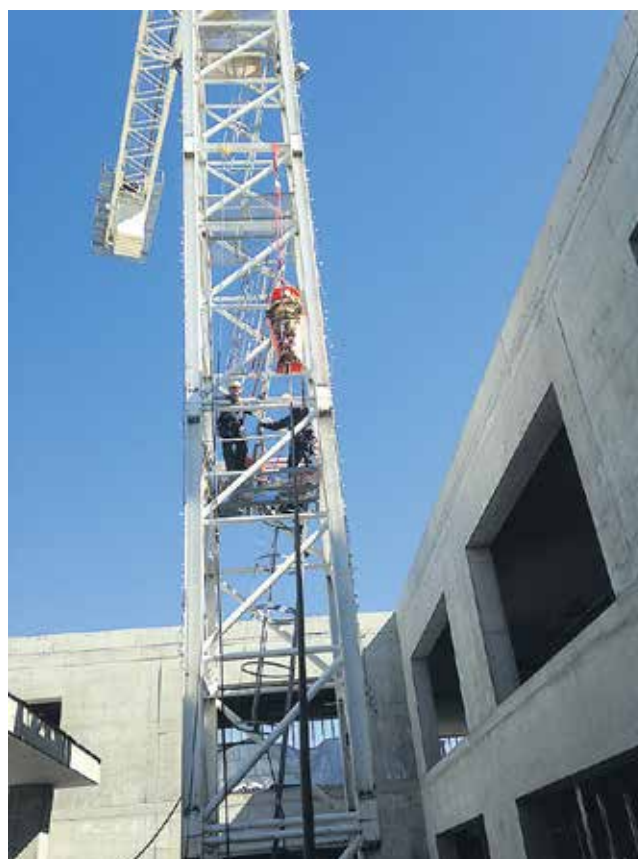
Firefighter Lee Pendergast (left) helps handle a dummy in a stretcher during a training exercise at the new Campbell River hospital.

Campbell River is about 265 kilometres northwest of Victoria.